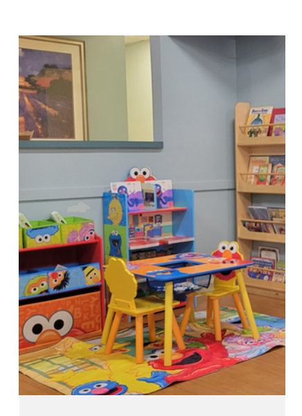
New Book Nook at Westside Fourth Street