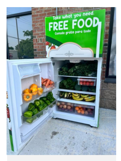
Fresh fruits & vegetables at Westside Dover's Community Fridge