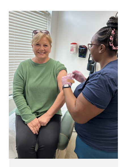
Served 28,000 patients annually