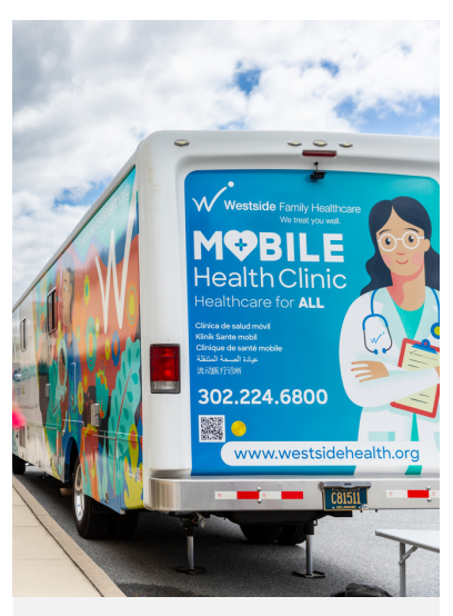
Onsite primary care at local farms for agricultural workers